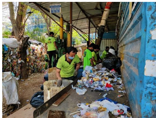
Asra NGO Visit