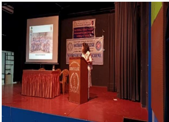
E Waste collection guest lecture and drive