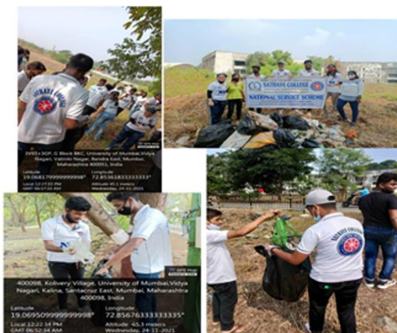
Swacchata Abhiyan and single use plastic camp

https://drive.google.com/file/d/1eCtvDnbrcesGeeENr82i70lAAHIcon1w/view?usp=sharing